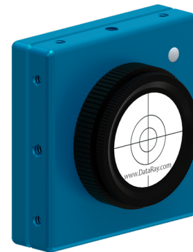
BladeCam2-XHR/HR 46x46x13 mm

The BladeCam2™ is paired with DataRay's full featured, highly customizable, user-centric software which has no license fees, unlimited installations, and free software updates. It is perfect for applications including: CW laser profiling; field servicing of laser systems; optical assembly; instrument alignment; beam wander and logging; R&D; OEM integration; quality control; and M 2 measurement with available M2DU stage.