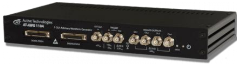
16 Bit – 1 GS/s Arbitrary Waveform Generator